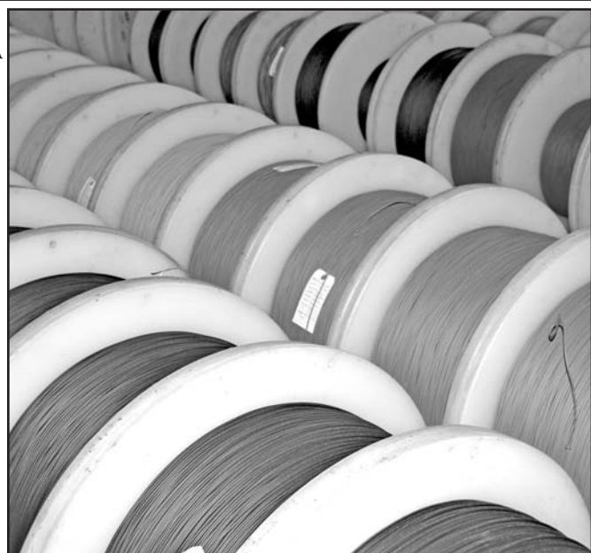
Advanced Digital Cable is a cable manufacturing company founded in Hayesville, North Carolina, in 1997.