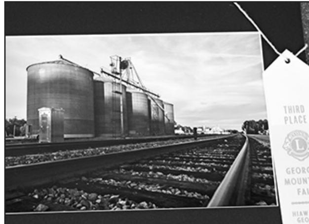
Grain Silos Along Railroad Tracks in Rebecca, GA