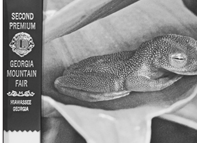
Sleeping Glass Frog, Atlanta Botanical Gardens.